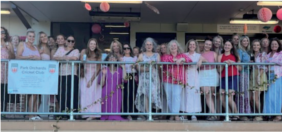
Pictured: 60 ladies attended the Pink Stumps Day recently hosted to raise money for the McGrath Foundation.

On Saturday the 1st of March the Park Orchards Cricket Club hosted their first Pink Stumps Day to support and raise awareness for the McGrath Foundation.